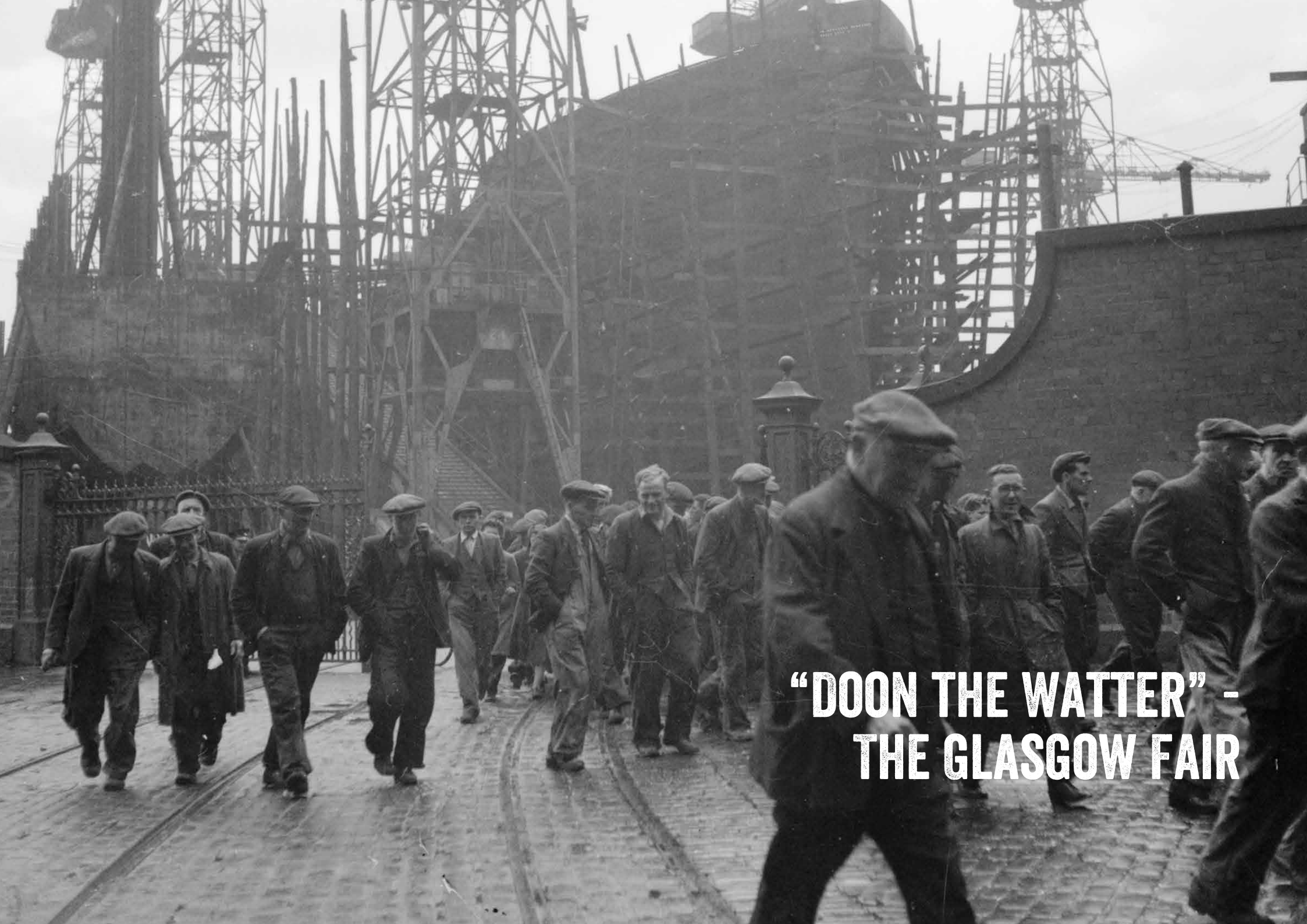
“DOON THE WATTER” - THE GLASGOW FAIR